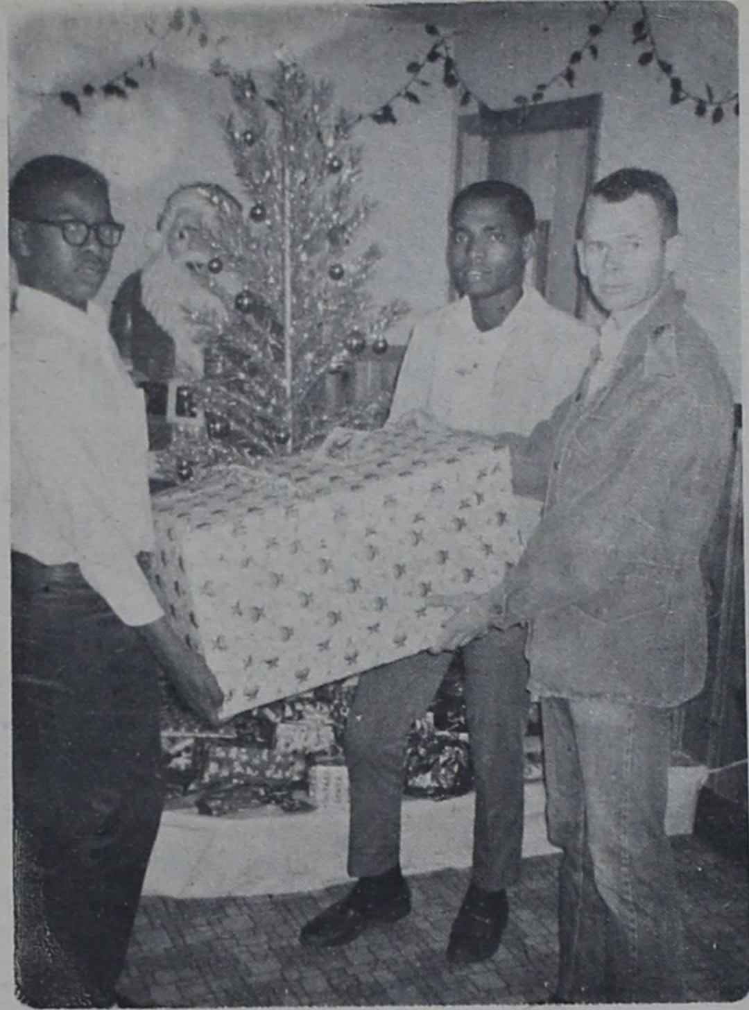
Students of Mary & Mac Private School, in keeping with the Christmas spirit, presented a box of toys to the U.S. Marine Corps last Thursday morning. This is an