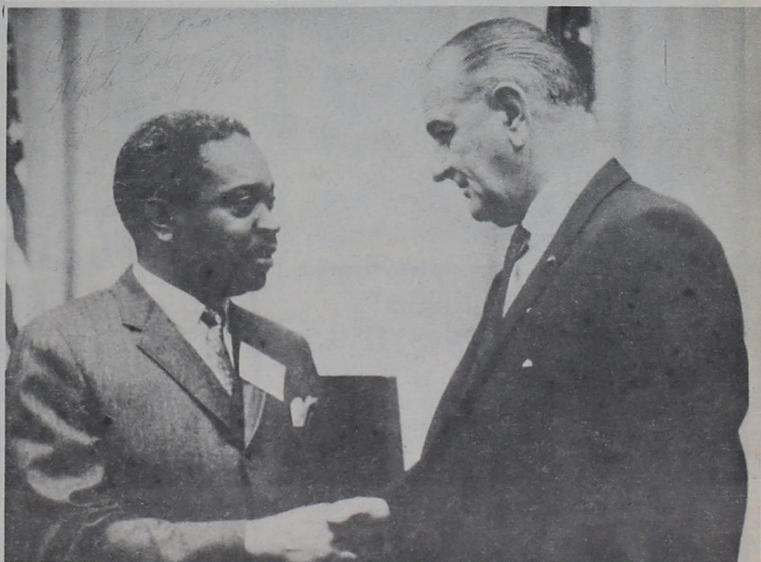
RECEIVING congratulations from President Lyndon B. Johnson for the fight which he and his integrated committee waged to secure a $399,967 OEO grant for a