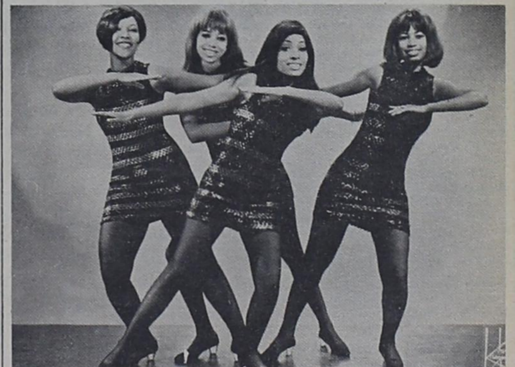
Look men, these young ladies—the Ikettes—would make a lovely group to take home to mom, but we would sure have to watch Pop. This group will appear Saturday night, January 4th, at 9:00 p.m. at the KOKO Palace with the Ike and Tina Turner Show. The Ikettes are well known throughout the country for their performances.