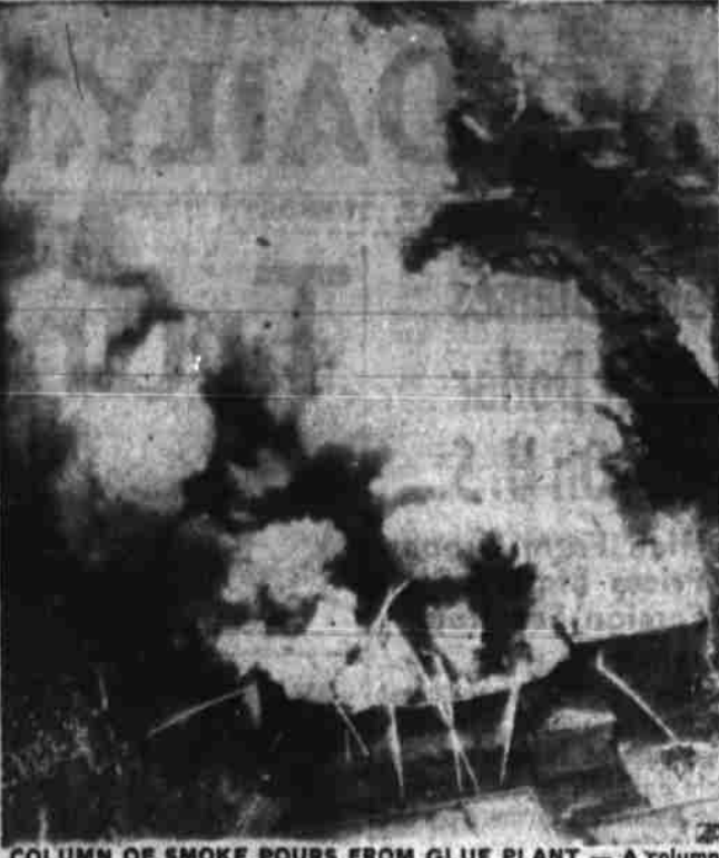
COLUMN OF SMOKE POURS FROM GLUE PLANT — A column of smoke pours from the Swift and Company glue plant as firemen fight a blaze in the five-story building in the stockyards district of Chicago. Two firemen were injured and two others were overcome by smoke. Company officials estimated damage at $500,000 in the plant which they said had not been operating for about two months but was used for storage. (AP Wirephoto).

LLANO, July 19. (U. P.)— Glen Mitchell, about 30, was electrocuted yesterday while working on a power line on a Llano County ranch.