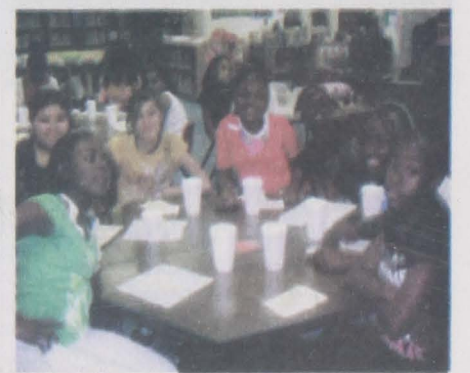
Parkway Roses, a program designed to help young fifth-grade ladies achieve success, is beginning its second year. Field trips, guest speakers, and programs geared towards learning how to be leaders in and out of school help take this group of special young ladies one step closer to realizing their full potential and purpose in society.