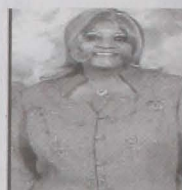
SOUTH PLAIN MALL