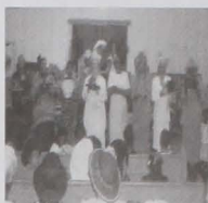
Hat Winners During 2008! What A Fellowship! God Is Good All The Time!

All ladies are asked to wear their hats!