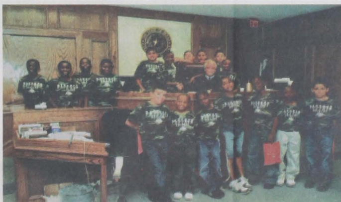
Here they are, the Parkway Panther Brigade members, who are shown visiting Judge Rusty Ladd's Court Room.