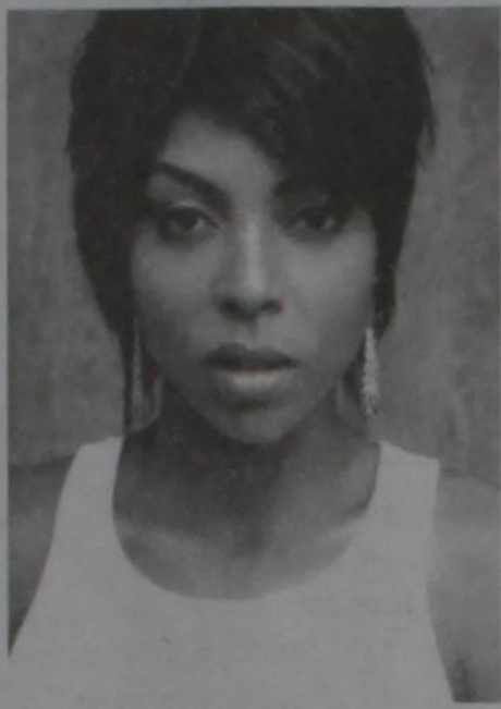
Taraji P. Henson

The program pairs students with faculty and staff members to assist them in their academic, social, and cultural adjustments to Texas Tech University. More than 2,500 students have been provided service through the program. In the last seven years, more than 530 student participants have graduated from the