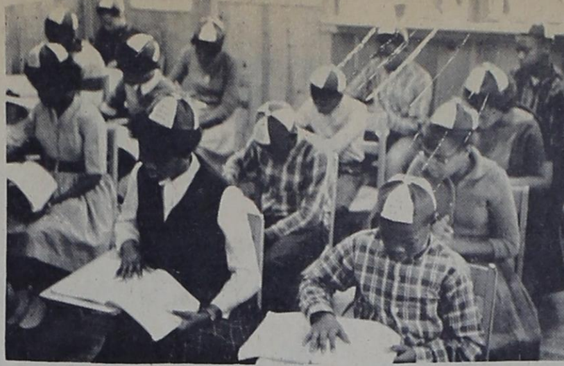
Upper classmen at the Mary & Mac School are caught in action as they

Any erroneous reflection appearing in this newspaper will be corrected immediately when called to the attention of the editor.