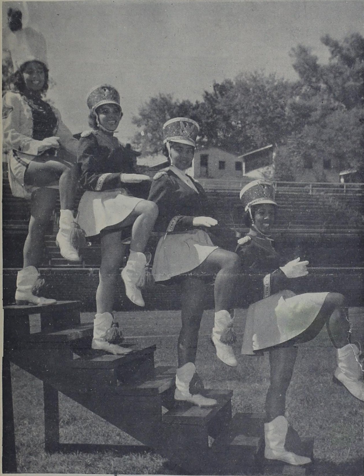
The Tennessee State Texans performed at New York Giant-Chicago Bear game, on Dec. 29, 1963, in Chicago.