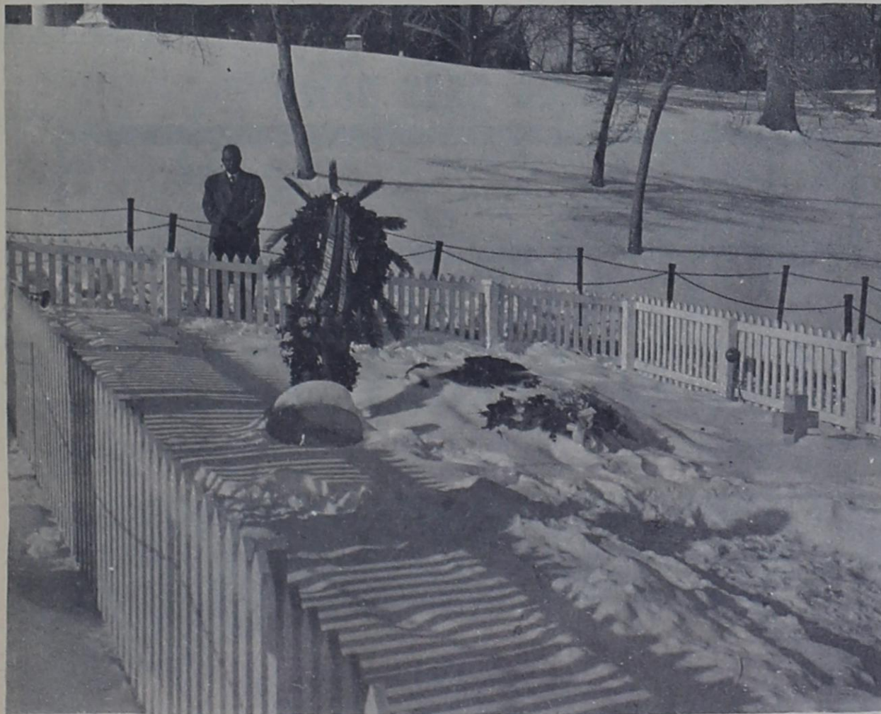
Pictured above is the grave of John F. Kennedy, former President, who was assassinated in Dallas, Texas last November. On the left of the former President is the grave of his son, Patrick Bouvier Kennedy, and at the right is the grave of his daughter. In the background of the