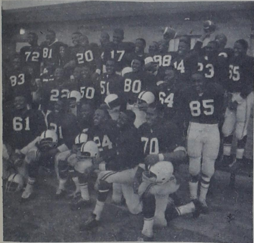
Pictured above are members of the 1963 State Championship Squad. These are some happy Panthers... This photo was snapped several minutes after they captured the State Championship....