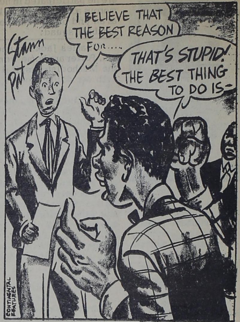
Disagree---But Respect the Opinion of Others.