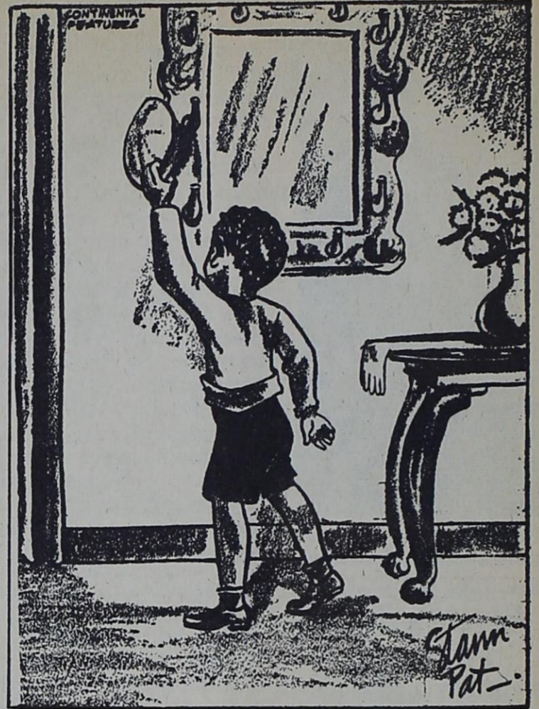
Now Is the Time to Teach Him. He'll Thank You Later.

briefed on voting and its various methods, why not try to use this opportunity--Really its worth the time---You won't regret it!