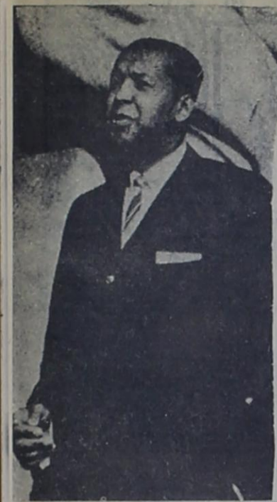
Negro lawyer Leon Higginbotham, Jr., has been

named one of America's "Ten Outstanding Young Men", by the United States Junior Chamber of Commerce.