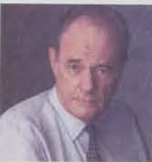
Jack Cafferty says Obama is getting things done even though he's made some mistakes.

NEW YORK (CNN) — What a welcome change to feel like someone is running the country instead of running it into the ground.