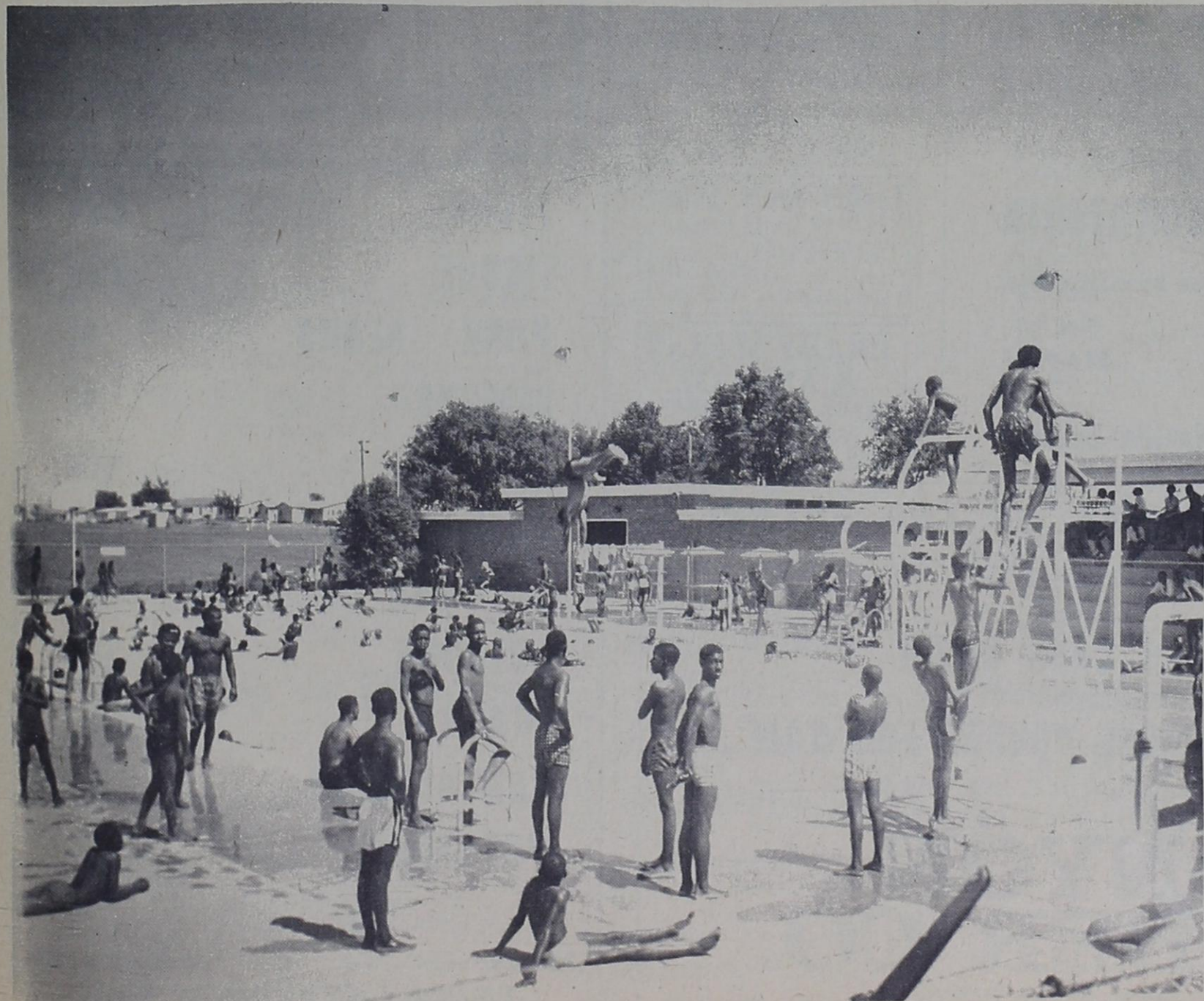
The largest crowd of the year attended the Mae Simmons Swimming Pool on Sunday, July 14th.