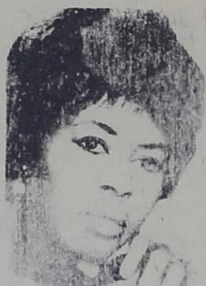
SEE AND HEAR THESE RECORDING STARS LOWELL FULSON, FREDDIE KING, POSCOE SHELTON