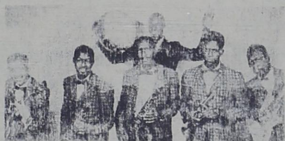
MAN & HIS RECORDING ORCHESTRA