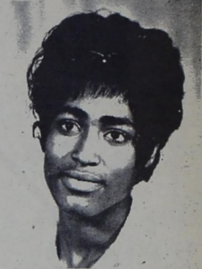
also included. The ex- Continued on Page 3

Members of the second period English 3l class prepared and displayed an exhibit related to their unit on Southwest literature. It includes maps of the Southwest, reports, and dolls dressed in native Southwest costumes. Sketches of southwestern writers are