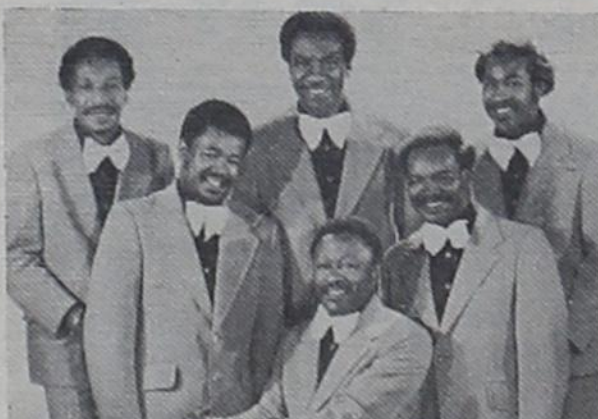
The Bright Stars Recording Stars