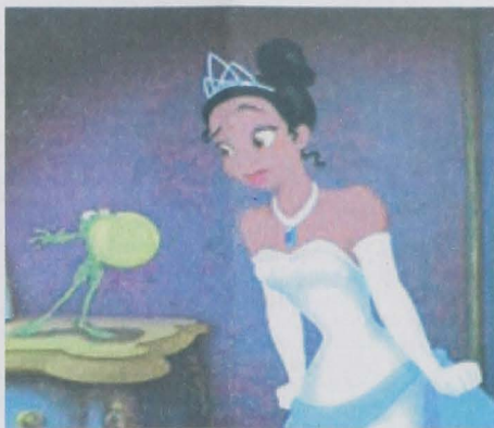
"The Princess and the Frog"

Discussion of the character's race had some of the film's principals bristling. "We walk around being black every day, and nobody talks about it," noted Anika Noni Rose, who supplies the voice of lead Princess Tiana. "So, I suggest you follow your instinct and let it be nothing to