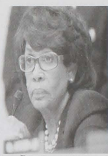
Congresswoman Maxine Waters - D. Ca.

But frustration has been building. The 42-member Congressional Black Caucus flexed its influence last week when 10 of its members held up a financial regulation bill backed by the administration until leaders agreed to add about $3 billion in foreclosure relief for struggling homeowners. Rep. Barney Frank, D-Mass., the House Financial Services Committee chairman, later added $1 billion for neighborhood revitalization programs. During the stalemate, the lawmakers issued a statement saying they would no longer support public policy "defined by the world view of Wall Street."