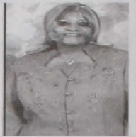
SOUTH PLAINS MALL Fashion fun...always wear a smile Fashion...just for the fun of it