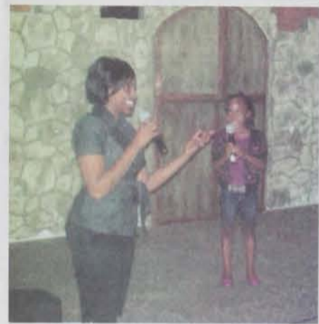
Mother and Daughter on program together. "The Strength of a Woman." What an evening for all in attendance!