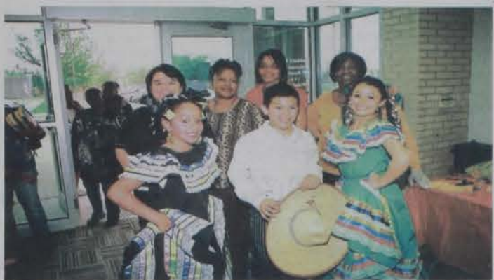
Patterson Branch Library celebrated Cinco De Mayo, Monday, May 4, 2009 with special guest the Ballet Folklorico Dancers. We had approximately one hundred citizens to come out and help us celebrate. Many times we hear the question, "Why Cinco De Mayo?" so we would like to let people know why we celebrate Cinco De Mayo, which is the 5th of May. Cinco De Mayo commemorates the victory of the Mexican Militia over the French army at The Battle Of Puebla in 1862. It is primarily a regional holiday celebrated in the Mexican state capital city of Puebla and throughout the state of Puebla. There is some limited recognition in other parts of Mexico, and especially in U. S. cities with a significant Mexican population. Many people often think that it is Mexico's Independence Day, when it is actually September 16.