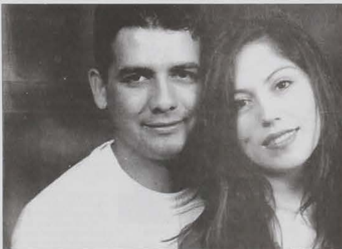
Meet the Pastors of the Church of the Blessed. The Church is located at 1809 34th Street. They invite those looking for a Church Home to come and visit with their congregation.

The number of baptisms is 40. The Church of The Blessed is still visiting the Lubbock County Jail with it's Jail Ministry where there were 24 saved and continuing. Prayer at the Lubbock County Jail is held at 5:00 a. m. Monday through Friday.