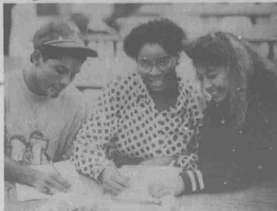
Texas Tech Upward Bound Seniors share ideas on activities for the National Trio Day Celebration.

Jaime Escalante received national acclaim when he used the power of motivation and the ability of his students to transform Garfield High School -- an inner city school dealing with low funding, violence, and poor working conditions -- into the seventh ranked school in the United States in calculus. Mr. Escalante is regarded as an outstanding example of excellence and dedication, not only