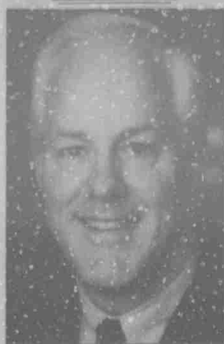
Ask Attorney General John Cornyn