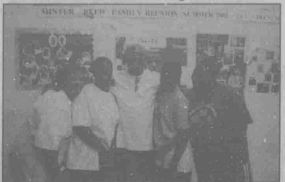
Some of the members of the Minter and Reed Families took time to pose at the Lubbock Housing Authority Center, 515 North Zenith, during their Family Reunion held here July 12-14, 2002.

At 6:30 p. m., the center was closed until 9:00 p.m. At 10:00 p.m., everyone was back in the building for an Adult gathering for family and friends until 2:00 a.m. Family members want to thank their Aunts, Great Aunts, and Uncles for attending by coming back at night. All had a wonderful time.