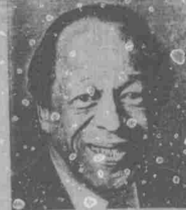
Cong. Gus Savage

Maquiladora-related business, including manufacturing of components along with trucking and warehousing operations, prospered along the Border. Petrochemicals, metals, plastics and electronics industries expanded on the Gulf Coast. High-tech expansion