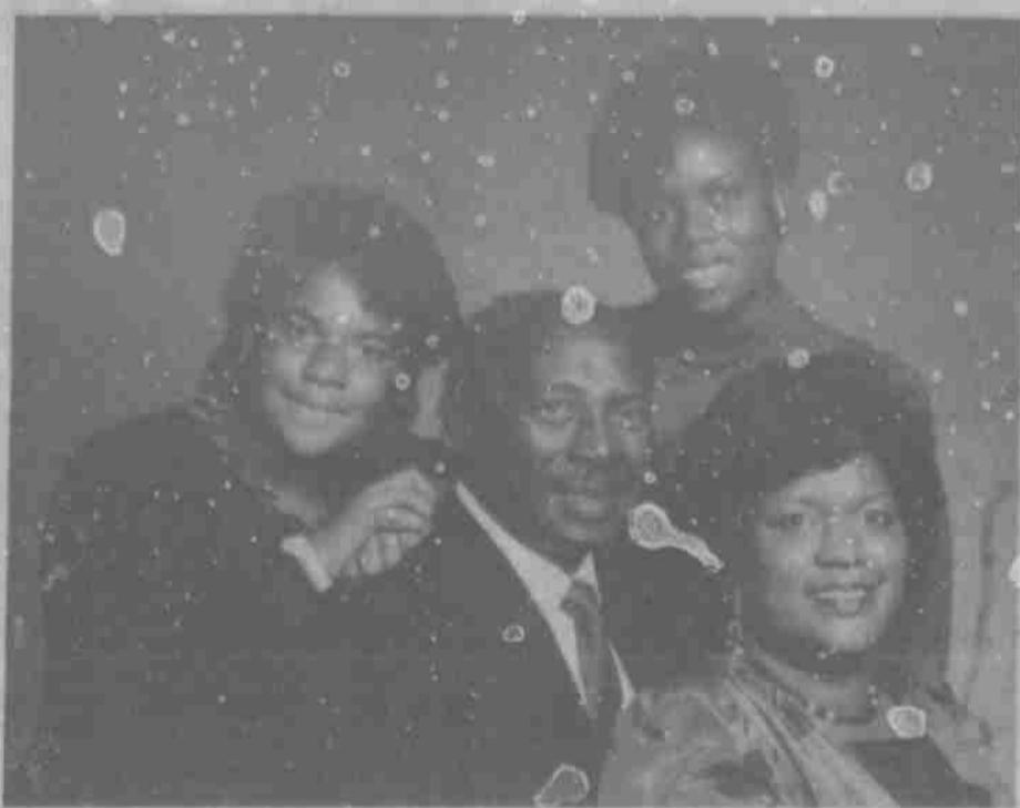
in this joyfull occasion. We are looking forward to a glorious time in the Lord, and to lift up

We take this opportunity to extend an invitation to all our brothers and sister in Christ to come out and fellowship with us