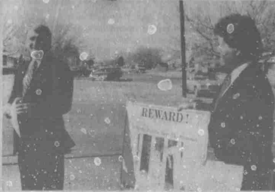
Jim Mattox Attorney General

LUBBOCK— Standing in front of a house that was the scene of drug-related violence and murder, gubernatorial candidate Jim Mattox Tuesday unveiled portions of this 16-point plan for the war on drugs, including a Drug Buster Program in which citizens who reported illegal drug activity could get a 10-percent reward for being the "extra eyes and ears of the police."