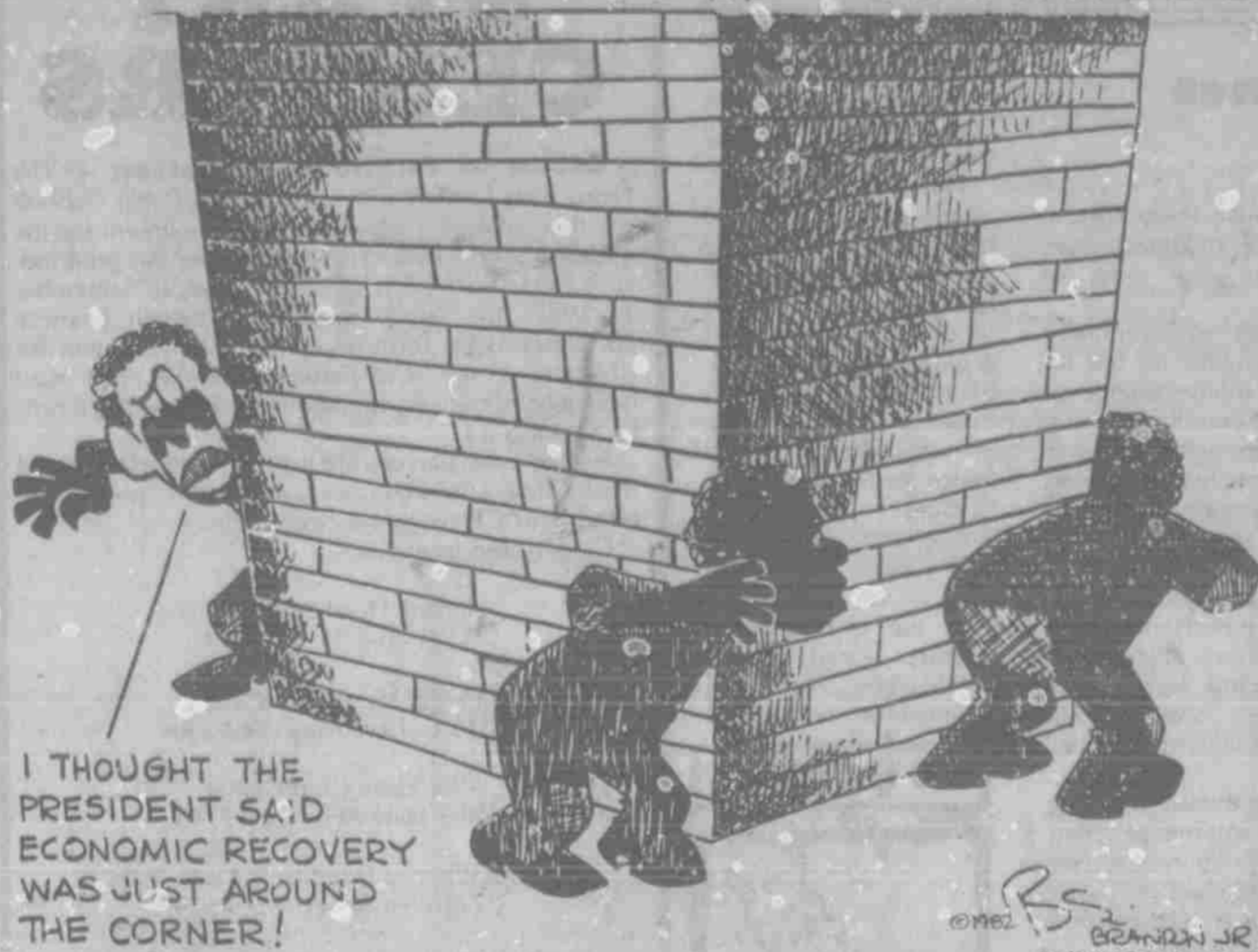
I THOUGHT THE PRESIDENT SAID ECONOMIC RECOVERY WAS JUST AROUND THE CORNER!

A Member of National Newspaper Publishers Association Black Press of America