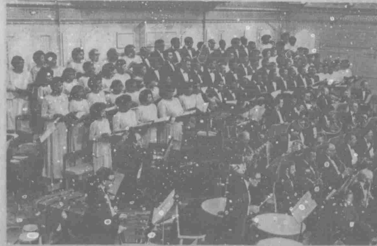
The Abyssinian Baptist Church Choir joins singer Nell Carter, and the