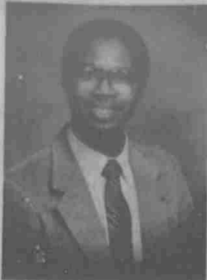
Minister David Phenix

Unitary Status means discrimination no longer exists within Lubbock Independent School District? Are we a Unitary