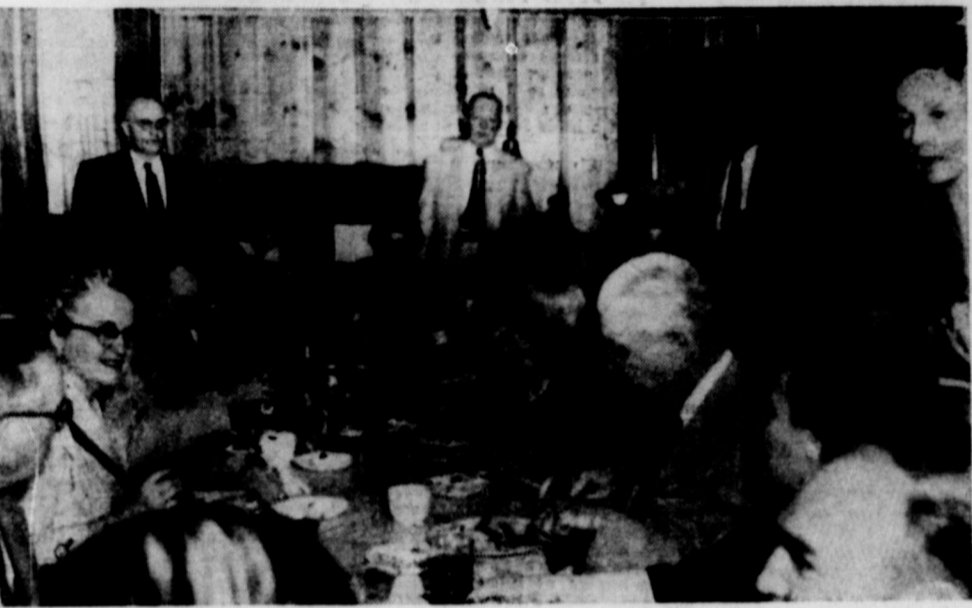
This is a part of the group that attended the Lions Club Ladies Night Tuesday night.