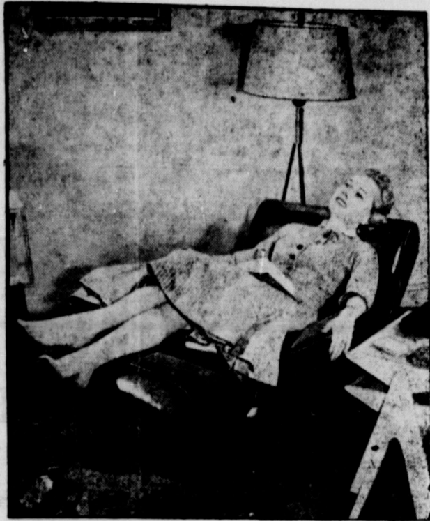
This homemaker is really sitting pretty. Reclining chair which is designed to ease strain at five key points helps to relieve tension. Chair modeled in simulated leather (plastic) that's stain resistant, easy to clean.

That's why it's essential for the housewife to relax a bit every day. A reclining chair will turn the trick because it eases tension at five points of strain: Shoulders, back, hips, knees and ankles. Then, too, it relaxes all muscles of the body.