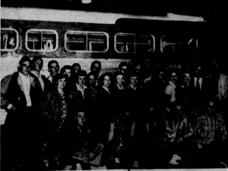
"AND AWAY WE GO" - a group of seniors and their chaperones as they loaded on the chartered bus for a week long "senior trip" to Galveston and New Orleans.

The one story building which is to be completed in sixty days will have a central heating system and a light brick veneer front.