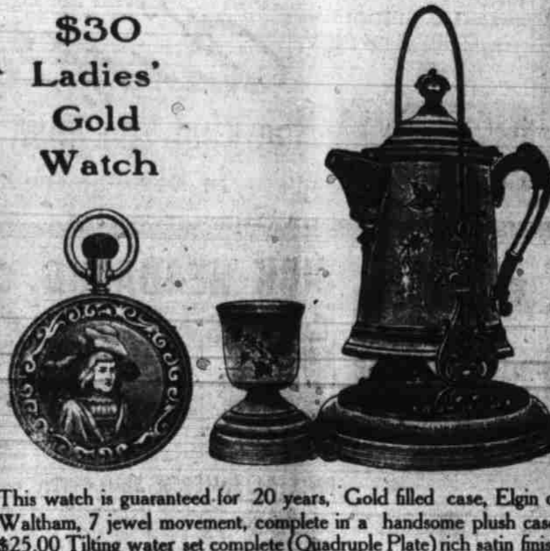
This watch is guaranteed for 20 years. Gold filled case, Elgin or Waltham, 7 jewel movement, complete in a handsome plush case. $25.00 Tilting water set complete (Quadruple Plate) rich satin finish