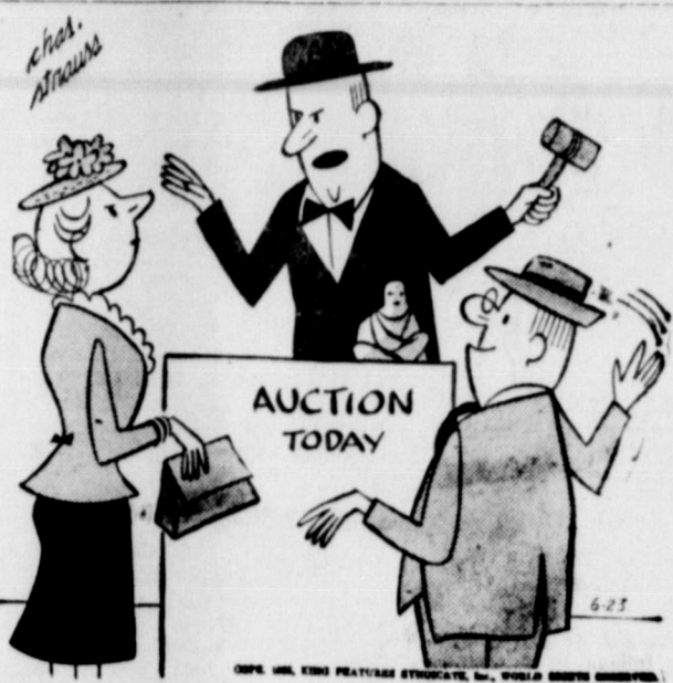
"Are you going to stand there and let this MAN have the final word?"