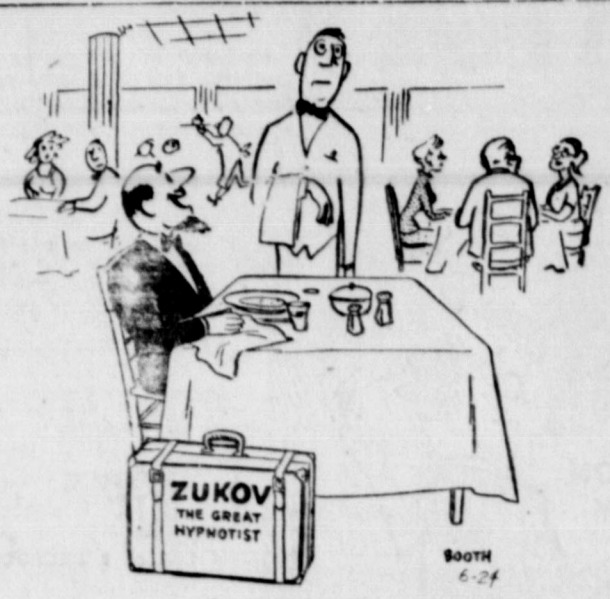
"That was excellent service, excellent!"