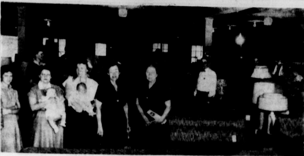
This is a group of people who visited the opening day Saturday for Brighten the Corner Furniture Mart.