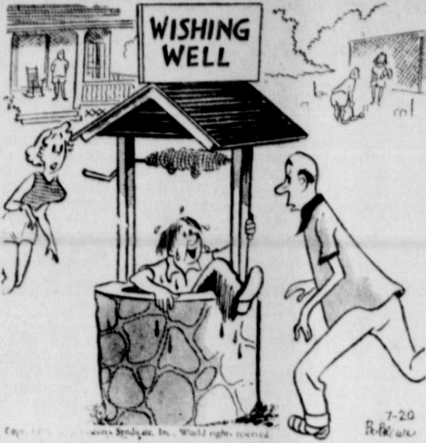
7-20 B.R. W. I didn't fall in! Just went down to get change for a half-dollar!

Assemble the rest of the picnic foods while beans bake. Hot dogs and marshmallows for the kiddies to toast. Plenty of hotchup, bags of potato chips, plums, grapes, and bananas. Chocolate cake (can bake with the beans). And a jugful of something cold to drink... food too, V.A. or lemonade.