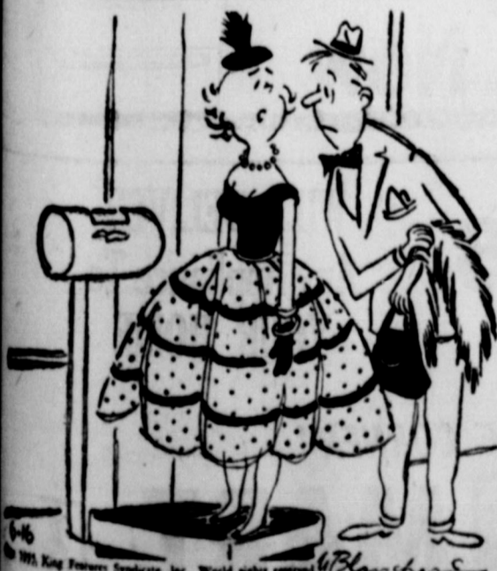
"Only ninety-seven-and-a-half pounds of this is really me."

SPRINGLAKE, TEXAS DAY PHO. 3483 — NITE 4190