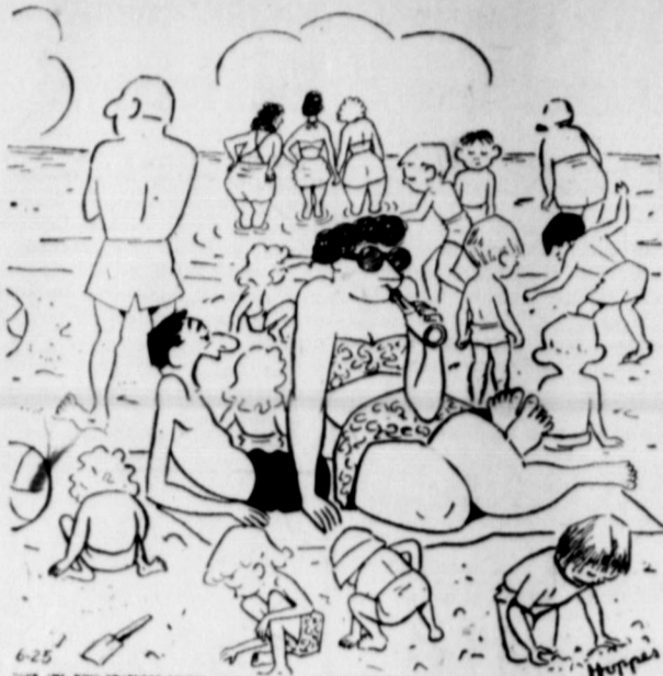
"Let's spend a quiet afternoon at home some week end!"