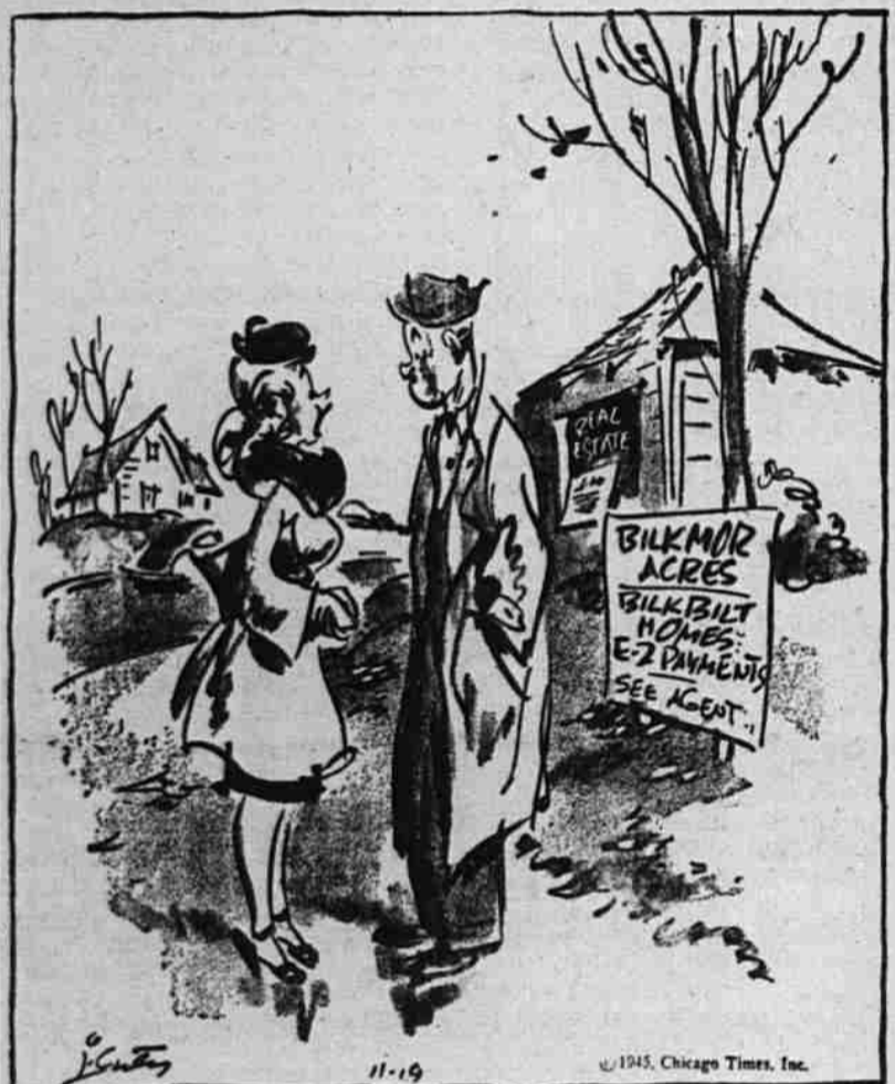
"Don't mention your GI loan privileges, Dear—it might discourage the agent from trying to sell us a house!"