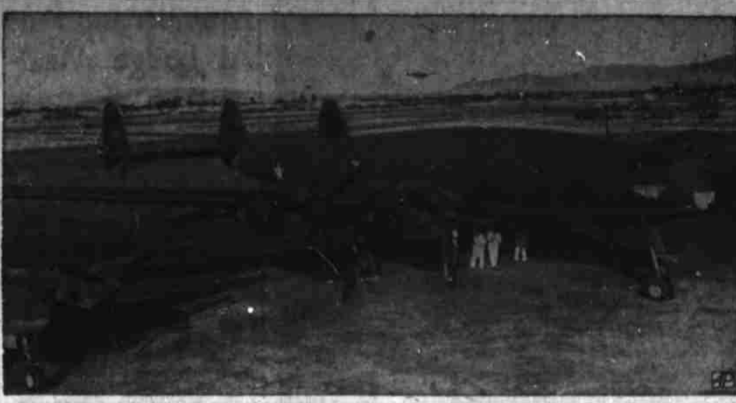
GIANT CARGO CARRIER—Lockheed's "Constellation" (above) was described by makers as "biggest, swiftest" land-based American cargo plane ever built. A F-35 is at left.