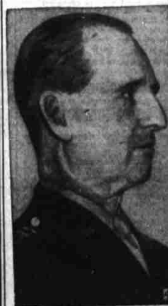
TRAINER—Lt. Gen. Leslie J. McNair (above), in charge of the training of all ground forces of the U. S. Army, aims to make Yanks a tough, smart military organization.