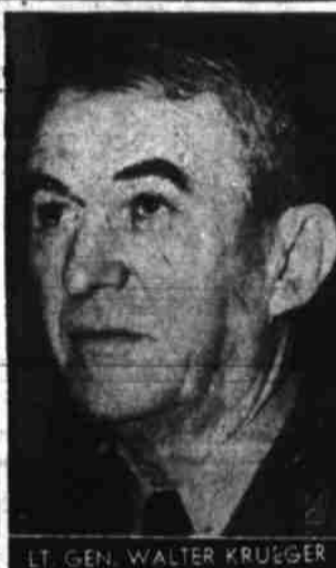
LT. GEN. WALTER KRUEGER

WASHINGTON, Feb. 18. (AP)—The arrival of Lieutenant General Walter Krueger in Australia to take command of a new field army of American troops, the 6th army, to be formed of units already in the Southwest Pacific, was announced today by Secretary of War Stimson.