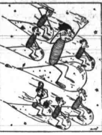
TUBERS TRAVEL on drops of moisture from an infected to uninfected area.

Huber the Tuber is the story of tuberculosis, how the disease is contracted and how a battle then rages in the lungs. The story—with sketches by the author—is a different approach to a deadly serious medical problem. Dr. Wilmer, a victim of the disease himself (he wrote the book while convalescent) draws a humorous parallel with a modern military campaign, and the sketches are as entertaining as the story. Throughout, however, Dr. Wilmer gives the reader a perfectly clear picture of what happens when the tuberculosis germ goes to work. The book, published by the National Tuberculosis Association, is as timely as any book can be. Medical authorities point out that an alarming increase in tuberculosis was experienced throughout the world after the last war because of lower living levels in conquered and devastated areas. Although America was neither conquered nor devastated, a marked increase was noted here. The increase is expected to be even sharper following this war, the Association warns, which warning should make Huber the Tuber some of the most pertinent reading you've ever done.