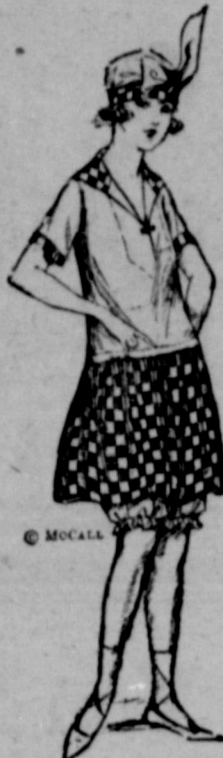
A Daring Combination

Amongst the latter the most popular is the ungleed beige-colored kid of three-quarters length. Sometimes the monotony of color is broken by wide black silk stitching, which is again edged with stitching of the same color of the gloves.