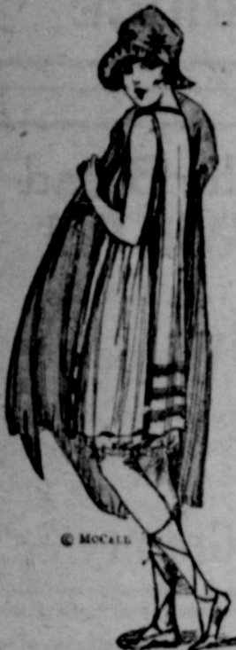
The Bathing Suit and the Panel

That April showers bring May flowers is merely another way of saying, now is the time to prepare for the pleasant days that will soon follow. Busy women realize this and also realize that it would not be as pleasant to work then as now. So idle fingers begin to fly and the dainty materials soon take definite form.