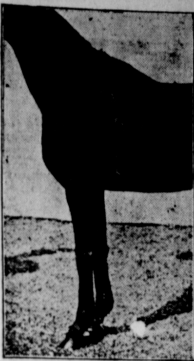
Deep, Well-Sloped Shoulders With Good Seat for a Collar.

respondingly short underline, whereas the opposite proportions, namely, a short back and a long underline, are desirable. The concussions or jars on