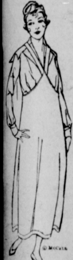
The Fetching French Apron Every day. There is something about them, and they are the most important part in the wardrobe of the woman who keeps up with the times.

It is astonishing the way the fashion of the apron, aside from its use, has swept over the country. These women are more interested in aprons that require an apron than have been since our grand-