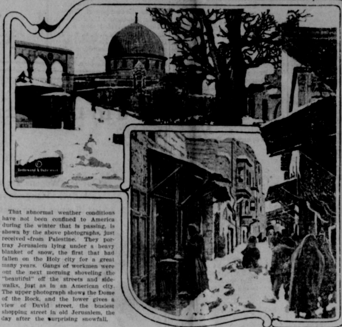
That abnormal weather conditions have not been confined to America during the winter that is passing, is shown by the above photographs, just received from Palestine. They portray Jerusalem lying under a heavy blanket of snow, the first that had fallen on the Holy city for a great many years. Gangs of workmen were out the next morning shoveling the "beautiful" off the streets and sidewalks, just as in an American city. The upper photograph shows the Dome of the Rock, and the lower gives a view of David street, the busiest shopping street in old Jerusalem, the day after the surprising snowfall.