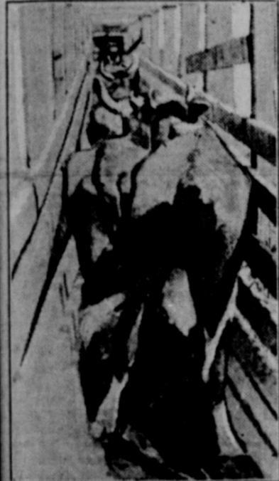
Cattle Being Put Through a Dipping Vat to Rid Them of Small Parasites.

The mite which causes common cattle scab may attack any part of the body covered thickly with hair, but the first lesions usually occur on the withers, on top of the neck just in front of the withers, or around the root of the tail. From these points it spreads over the back and sides, and