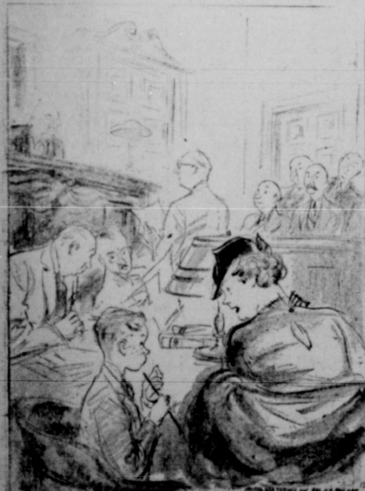
"Mickey, you're going to lose this case for papa if you don't stop shooting beans at the jury!"