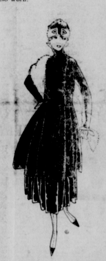
Distinctly Russian in Effect

and brought before the public for the sories in every form are displayed to world of fashionable women to pass on the greatest advantage in the stores. The very latest influence in dress Bags of all descriptions there are, for has come from the Far East. Japan. these are considered a very necessary ese and Chinese embroideries and like addition to the wardrobe in these and have taken quite an important and beads are seen in such a variety of colors and shapes that no one can possibly have any difficulty in selecting those that will harmonize with her costumes. Of black velvet with a band of Paisley placed at the bottom or in the center, are some very attractive round bags finished with long silk tassels. Others show Chinese embroideries in gold and colors. The bead embroidered bags of silk and velvet are still popular. Silver mesh bags