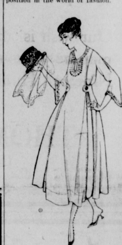
Showing the Oriental Influence

effects have come in for recognition days. Bags of velvet, suede, ribbon position in the world of fashion.