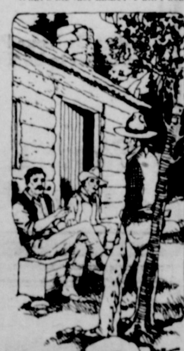
How Come You Call Him 'Crumbs?'"