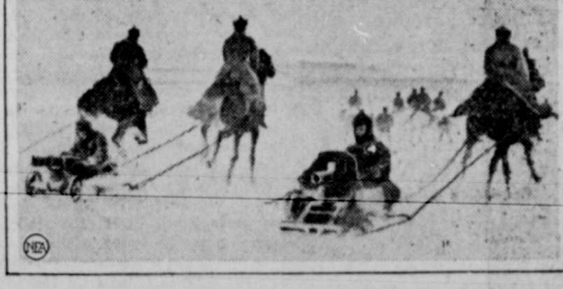
The spirit of Amazonian warriors of old flames in the women of Russia, as the top picture shows, their mounts wearing harness that may be attached to skis, in the maneuvers at the school of the Society for Chemical and Air Defense in Moscow. Below is an interesting race, in which Soviet cavalry troopers pull machine gunners and their weapons on sleighs at a horse-ski sport festival on the Moscow river.