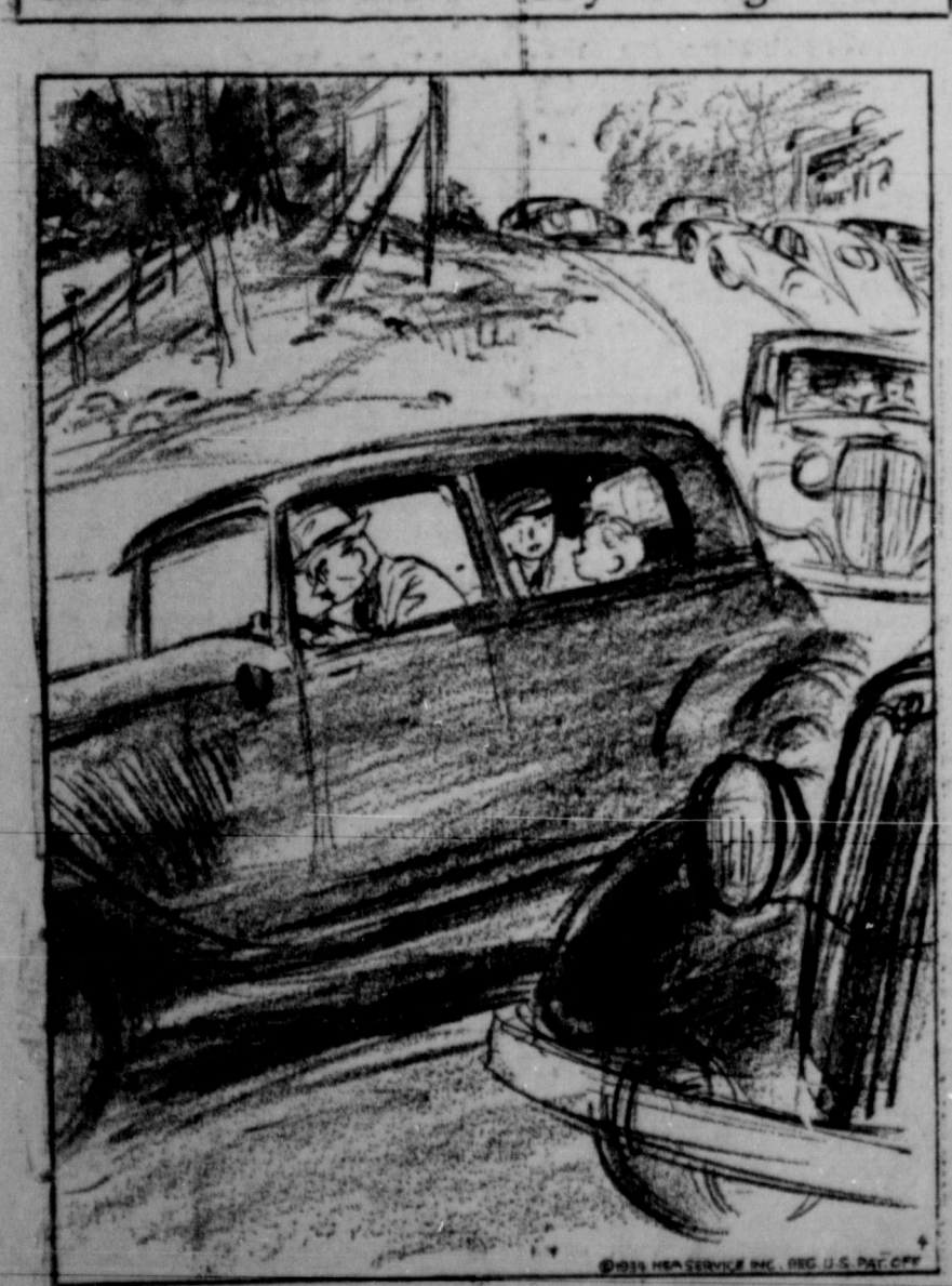
"No, we're not stopping for any firecrackers! Daddy is in a big hurry and besides they're too dangerous.