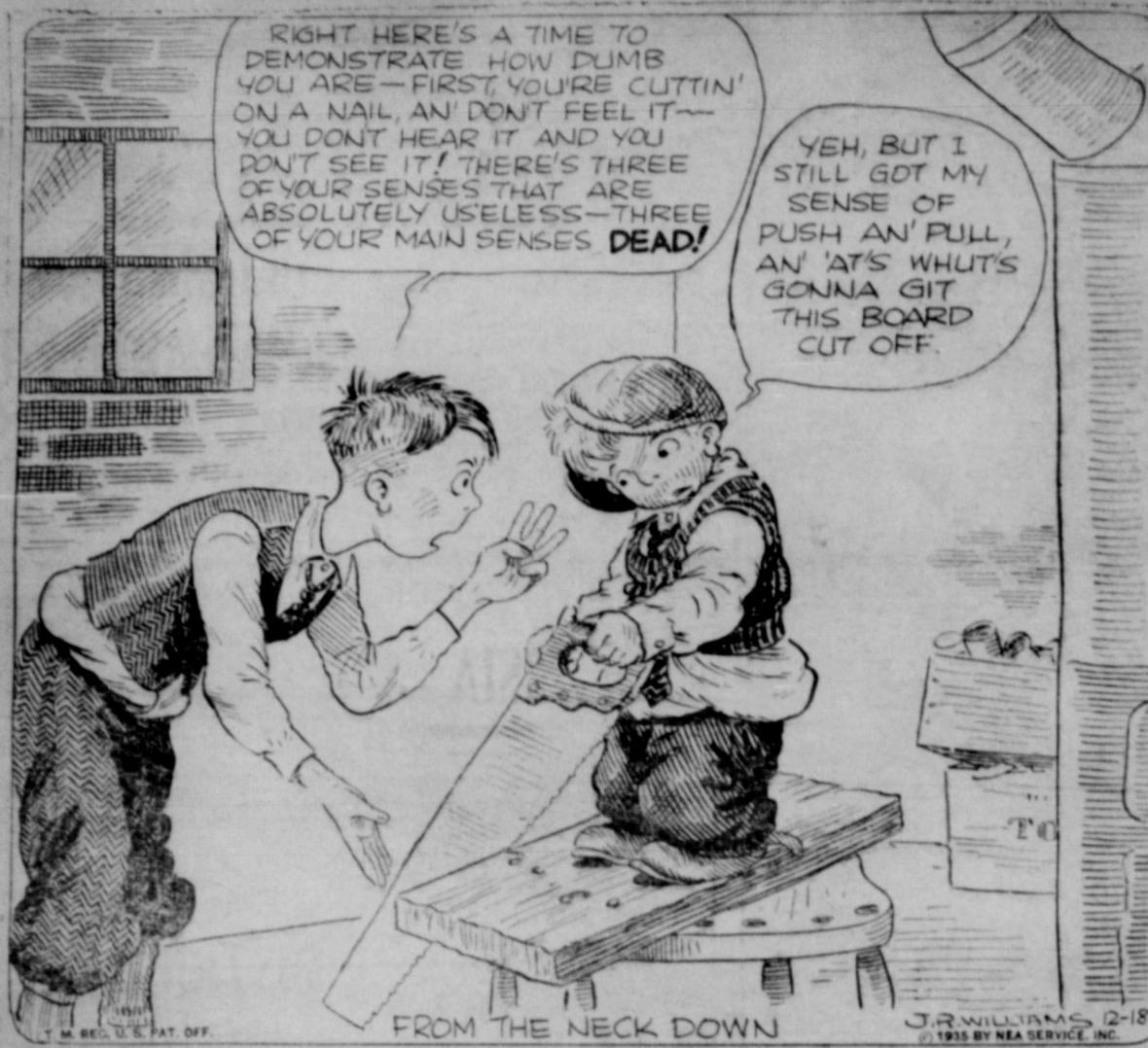
FROM THE NECK DOWN