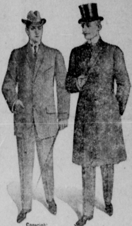
Copyrighted by SCHLOSS BROS. & CO. Fine Clothes Makers Baltimore and New York

No high and fancy prices here to discourage the man who enjoys being the first to wear these new things.