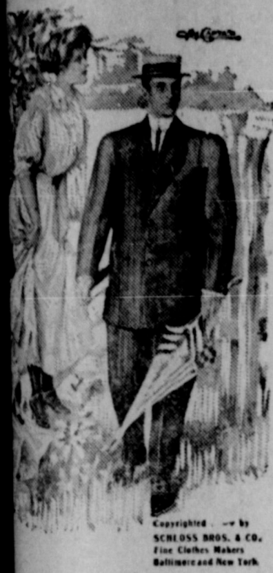
Fine Clothes Makers Baltimore and New York

with all its Fall and Winter freshness. New styles in clothes for men boys and children. New hats, new Creations in togery will greet you at every turn. We have handsome new Suits, the celebrated Schloss clothes, for men, luxurious overcoats and new trousers are all here.