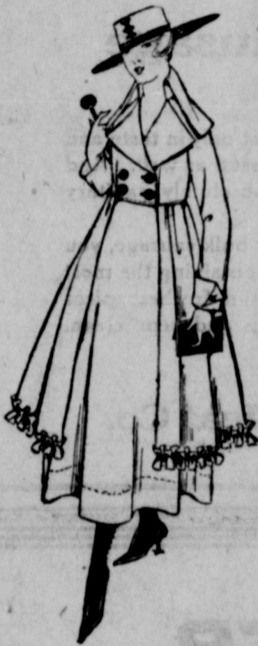
Reflecting the Directoire Style

We have lately been hearing rumors from Paris that the period of the Directoire is likely to make itself felt again in our dress. Although these rumors have not been confirmed from all sides, here and there a costume appears highly suggestive of this period, so it will hardly be looking too far ahead to give it some consideration. Period styles keep recurring every little while, and for some time we have had no strain of the Directoire in our dress, so there will be little wonder if it should return very soon. And there will be