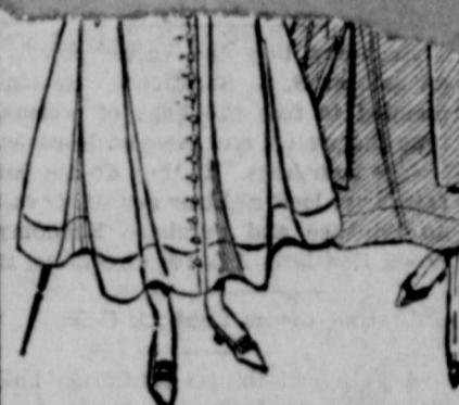
Satin Street Costume A Distinctive McCall Pattern No. 7371 and McCall 7379. Two of the many new designs

Scott & Bowne, New York, N. Y. Drives Out Malaria, Builds Up System. The Old Standard general strengthening tonic, SCOTT'S EMULSION, such as this TONIC, drives out malaria, builds up the blood, and builds up the system. A few weeks. For names and addresses, see