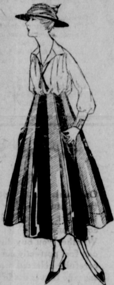
A Skirt of Many Gores

Collars, high in the back and open in front, on the order of the one in the illustration, are very good style. Even in separate collars to be worn with dresses and suits, the style that goes well up in the back and almost touches the hair is one of the very newest from Paris. Most collars continue to be very large, though some small ones are seen.