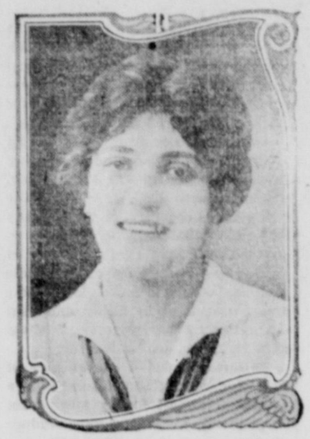
THURSDAY, APRIL 6