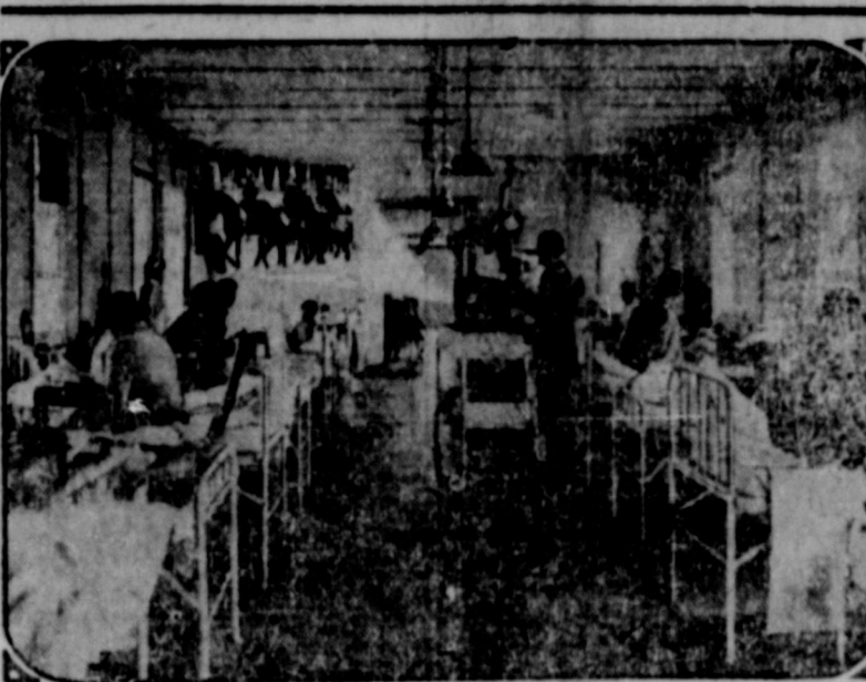
The American Red Cross conducts its recreational work in hospitals through trained men and women, introducing a multitude of recreations suited to the handicaps of the men. The accompanying view of a hospital ward shows in operation a moving picture projecting machine, developed by a Red Cross recreational director, which throws the pictures on the wall so that the men do not have to stir from their cots.