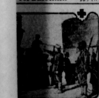
table mountains of relief sent out by the millions of workers during the war American Red Cross one of "manufacturing concerns" with great warehouse stores of strategic points all globe. the biggest distribution center Saloniki, Greece, and in a Bulgarian prisoners of war on their unloading a Red of 2,500 boxes of a support. At the right is the American Red Cross which were used in of points where the suffering.