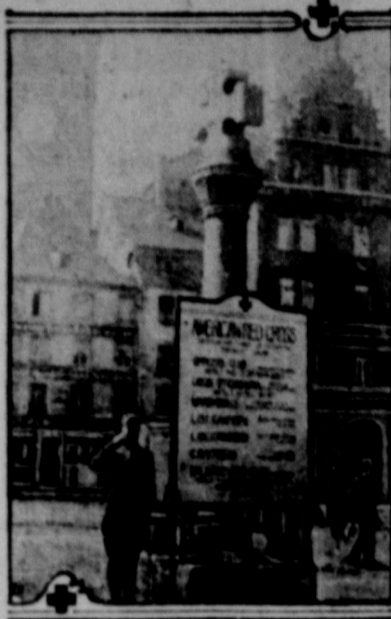
In the City Square of Treves, Germany, headquarters of the allied military forces, an ancient cross surmounts a monument marks the city's center of traffic. For this reason American Red Cross officials converted it, as shown by this picture, into a directory of all Red Cross activities in the city.