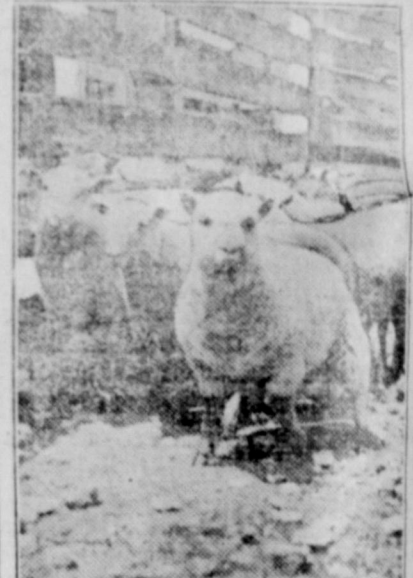
Choice Lot of Spring Lambs.

Every pure-bred lamb in the flock should be marked. If possible, they should be marked the day dropped. Lamb-size labels are sometimes used with success, being later replaced with the regular size labels at weaning season. It has been said that using the sheep-size labels on young lambs causes their ears to droop, but some experienced men say this is not true. The breeder's label is inserted, and should have on it the flock number, if more than one flock is kept, and initials or name of owner. The most popular label is a metal band, and it has not only been adopted by most of the