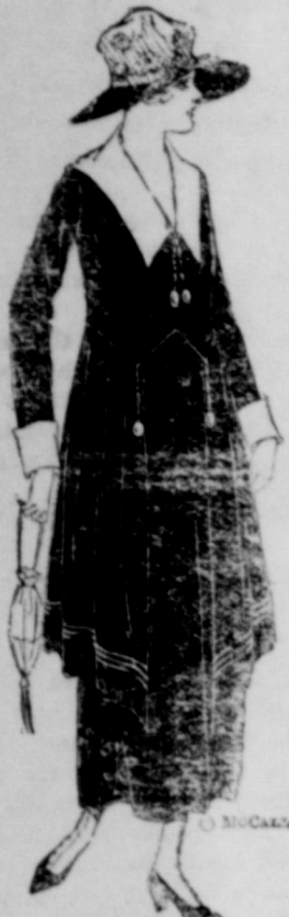
Semi-Fitted Dress of Velvet

There is a kind of breathless interest here in New York, over the battle of the bustle and straight silhouette. To day, one is sure that the long skirt and tunic, in other words the straight silhouette, is triumphant; to-morrow, there may be seen so many charming examples of the bustle frock, both on the street and on the stage, that one thinks it surely will be accepted. However, at the present moment, the one-piece dress and the frock with the long tunic seem to be the favorites.