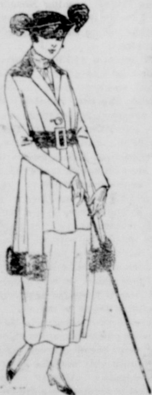
The Straight-Line Silhouette

After all, there is nothing that can take the place of the coo suit, that old stand-by of ours. Made of velvet, velveteen or any of the soft woolen