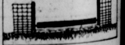
Roller Turns Hogs Back.

Your correspondent should get a round post or timber six or seven inches in diameter and eight or ten