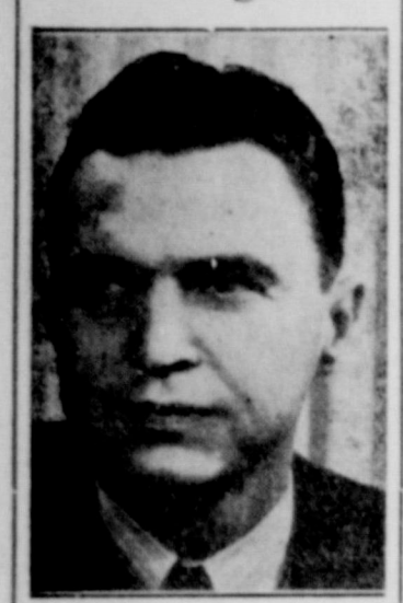
"The Common Folks' Candidate" Had 6 years experience in State Legislature, Endorsed by Wheeler Courses

eler County Agricultura Association and Union Labor (This ad paid for by