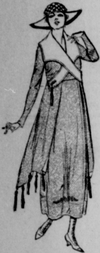
When The Tunic Points the Way to Slenderness

Beige is being worn for street costumes almost as much as the ever popular blue. Favorite combinations are navy blue or black and beige. All white dresses are also very popular. Made on youthful lines they are as becoming and proper for the debutant as for her mother. Of course, black satin, Georgette crepe and velvet will be worn in great deal this winter for the more dressy costumes. The black gown illustrated here has long hip-drapery which seems to emphasize