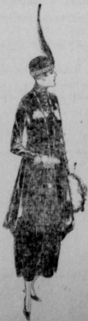
The Smartness of Black Satin the slimmness of the silhouette. The high collar has come into its own again. It has, indeed, been banished

too long, for it certainly gives an air of trimness to the costume, not obtained by the comfortable open neck. This one is of black satin of the dress, and fastens with tiny black jet buttons.