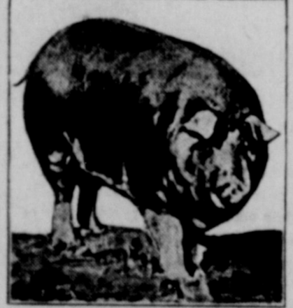
Extra Fine Specimen.

The brood sow must have plenty of clean, wholesome feed. The feed