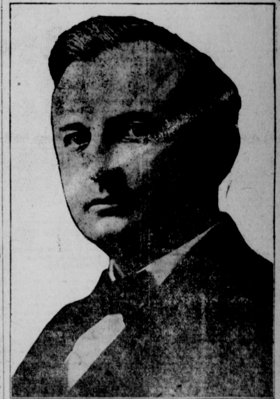
James E. Ferguson

Says Trial Farce Because Personal and Political Enemies Sat as Judges. Nigger Crapshooters Are Given Fairer Trial