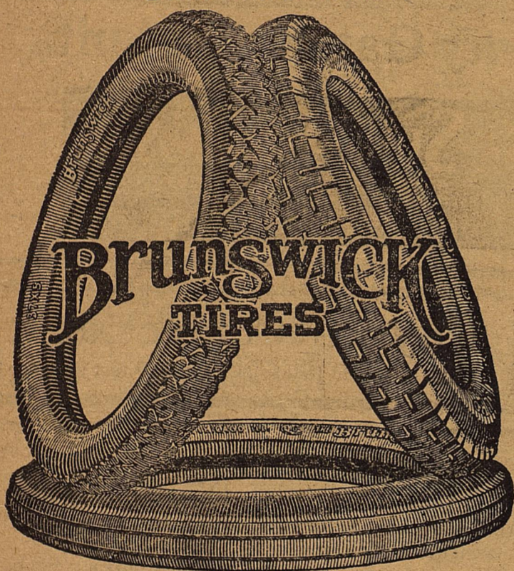
Cord Tires with "Driving" and "Swastika" Skid-Not Treads Fabric Tires in "Plain," "Ribbed" and "BBC" Skid-Not Treads

Sold On An Unlimited Mileage Guarantee Basis