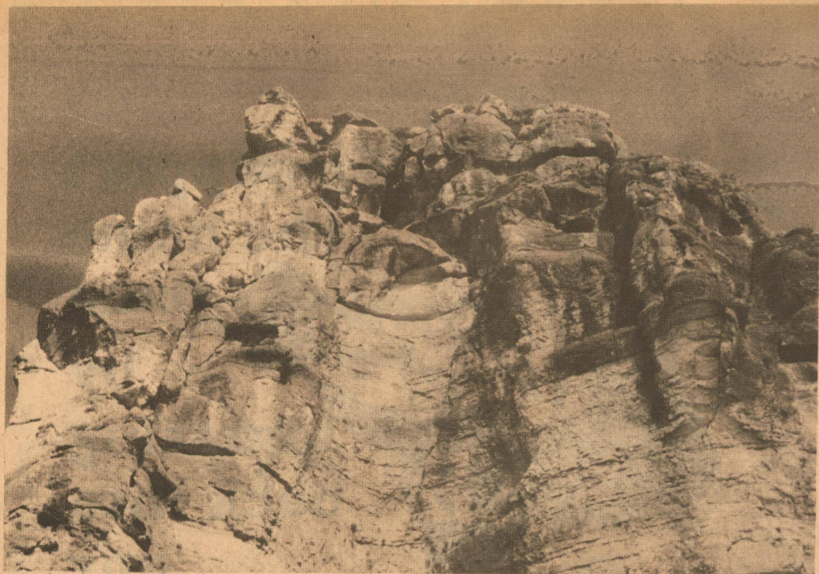
A solid rock frame.....for the Devil's.