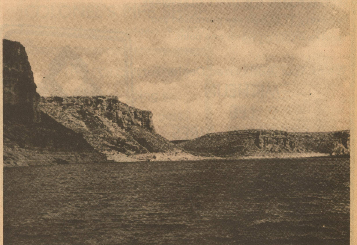
The Devil's River...flowing toward Rough Canyon.