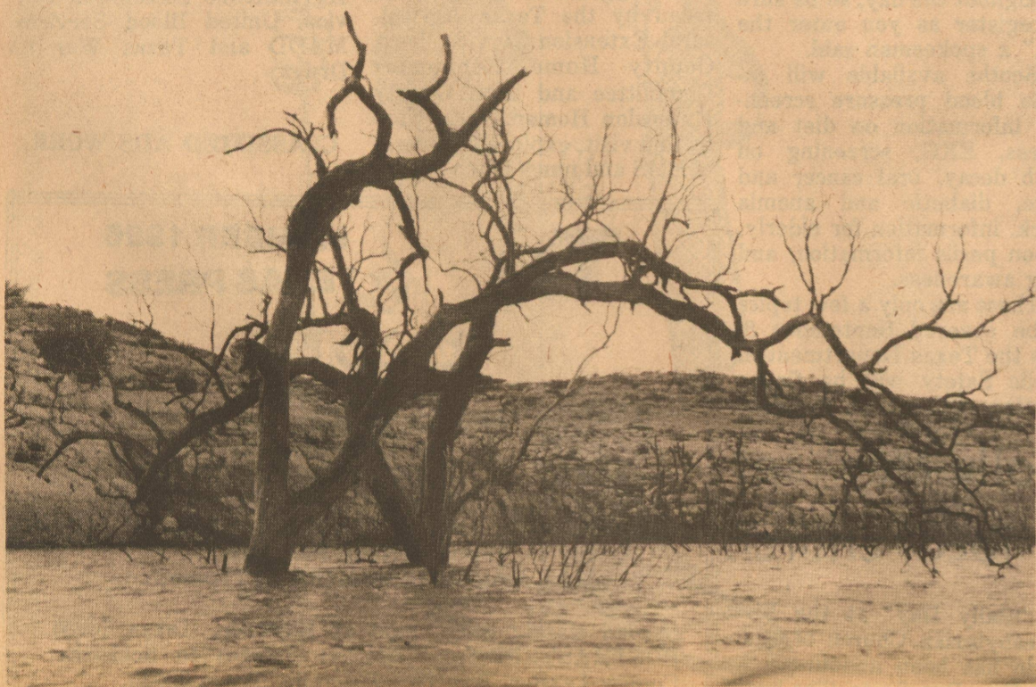
Amistad water covered everything on the river.