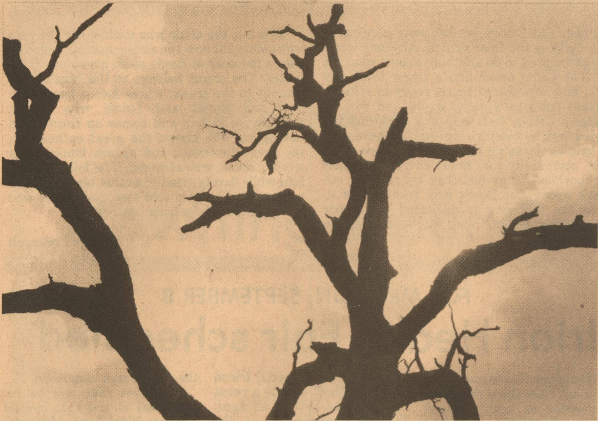
Gnarled trees...reaching to the sun.