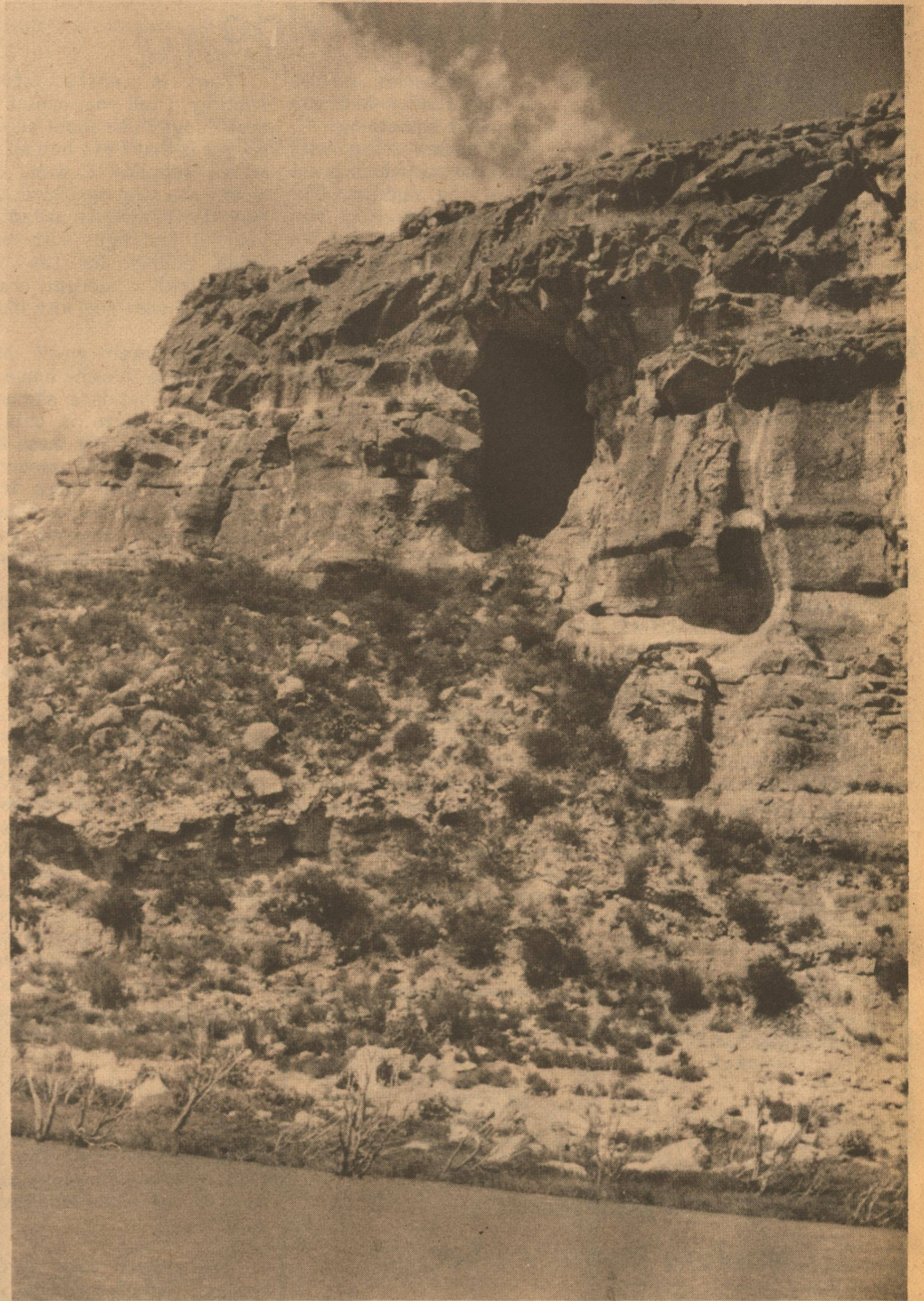
Gaping holes...ageless shelters for man, animal.