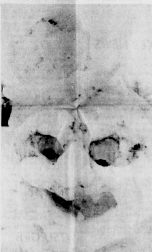
This eight-foot-tall snowman was built by the Rev. Z. A. Myers family and some neighborhood children at the height of last week's storm.