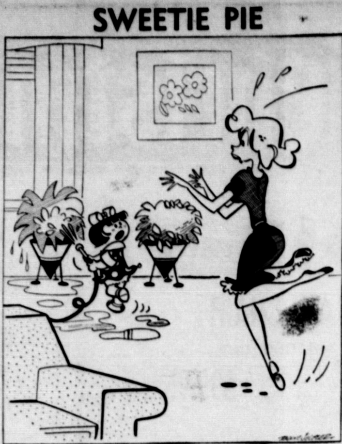
"You TOLD me to water the plants!"