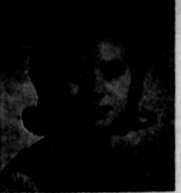
Donella Dopslauf dairy

Girls who mastered culinary arts, sewing and Holsteins were among Texas delegates at the 45th National 4-H Club Congress in Chicago.