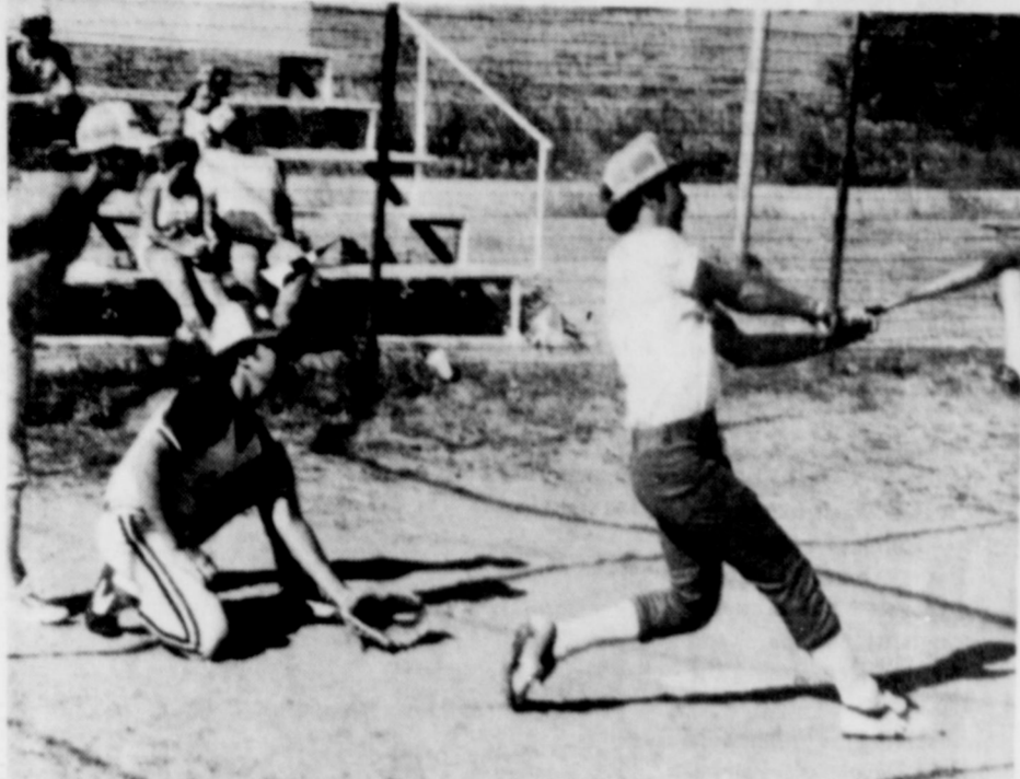
THE BATTER TAKES a cut at the ball during the final game of the McLean Softball Tournament Sunday afternoon.

Sixteen men's softball ament last weekend, with J. Bob's of Pampa winning the championship.